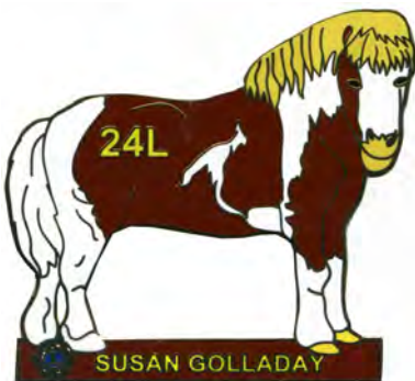
FG 0530 23