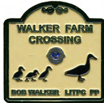
FG 0535 23 Bob Walker (SC) Momma Duck & Her Little Ones Crossing the Road

NOTE: The pins above are the first two in an eventual eight pin set.