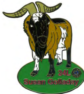
FG 0531 23