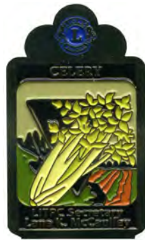
FG 0537 23 Lana McCaulley (PA) The Celery Stars of the Vegetable Garden