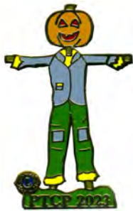
FG 0536 23 Pennsylvania Pin Traders "Mr. Scarecrow" NOTE: This is the 5th in a set of 6 to be issued.