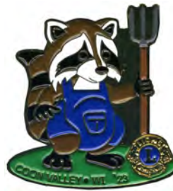
FG 0537 23 Coon Valley Lions (WI) The Little Coon Farmer Ready for Work in the Fields